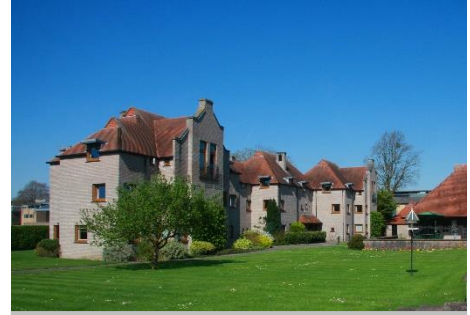
117 St Aldates Building