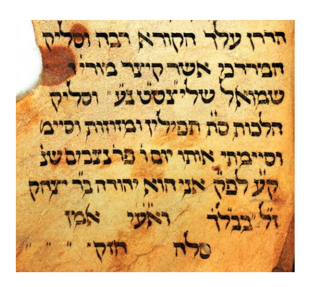
Fig. 196.2: The colophon on fol. 89r of codex 196.

Notwithstanding, it has become one of the most authoritative and influential sources of medieval Ashkenazi Halakhah .